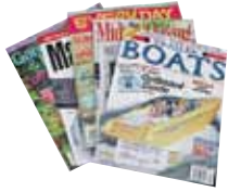
Magazines & Catalogs All types & sizes