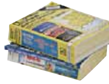
Phone Books All types & sizes