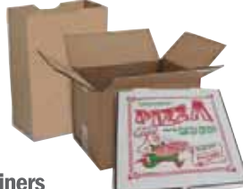
Cardboard, Pizza Boxes & Paper Bags Flatten cardboard and if needed put next to your tote at no more than 4' pieces . Remove wax paper from pizza boxes