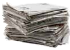
Newspaper Remove bags, strings & rubber bands