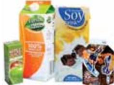
Food & Beverage Containers Empty containers only