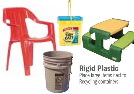
Rigid Plastic Place large items next to Recycling containers