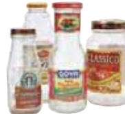
Empty & Clear Bottles & Jars Only