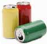
Aluminum Cans Empty cans only