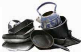
Kitchen Cookware Metal pots, pans, tins & utensils