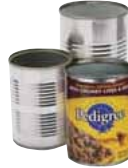
Steel & Tin Cans Empty cans only