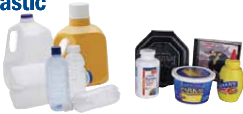
Plastic Jugs/Bottles/Household Plastic Empty containers only