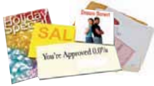
Office Paper & Junk Mail Envelopes, Flyers, Brochures, Postcards, etc.