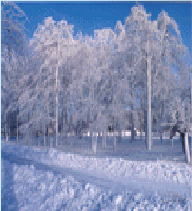
Niagara Falls State Park in winter

One of the most beautiful spots in America, the Niagara Reservation State Park surrounds the magnificent Niagara Falls. The park, which includes Goat Island, Three Sisters Islands and the Prospect Point area, offers a visitors center which has information on the history, geology, and technology of the mighty Niagara. The park is open year round. It is a joy for any naturalist and offers many opportunities to explore the islands and see a spectacular view of the Falls and the Niagara Rapids. In 1879 Frederick Law Olmstead wrote that he had traveled four thousand miles throughout the continent "without finding elsewhere the same quality of forest beauty which was abundant about the Falls." The islands contain original tree and shrub growth which has not been disturbed. Niagara State Park offers magnificent opportunities for bird watching and photography. Gulls in significant numbers and variety can be observed and photographed in this area. You can also catch site of peregrine falcons, sandpipers, chickadees, ducks, and, at times, American bald eagles. State Parks offers guided hiking tours. For more information call (716)278-1796