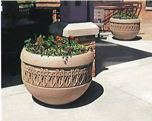
Model TF4220 | Westlake II Band | Buff

Accent any exterior environment with the distinct style of these 36"Dia. x 24"H outdoor concrete planters. Select from the 9 unique Cast Band options to customize the look of your planters. Add the optional reservoir system to extend plant lifespan while reducing the frequency of watering.