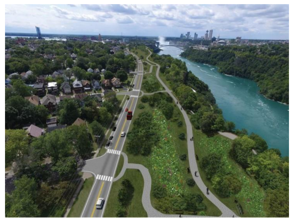
(Rendering of RMP Parkway Removal)

Thank you for considering an investment in the City of Niagara Falls. 631 Chilton Avenue is located on the brim of the Niagara Gorge. In March 2016, New York State Governor Andrew Cuomo announced a major waterfront renovation project that includes the removal of the Robert Moses Parkway (Phase II) beginning in 2017. Chilton Avenue, the city's oldest street, will finally have pedestrian access to the majestic Niagara Gorge and newly created park land.